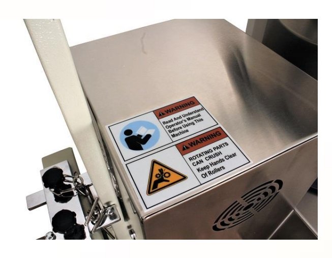
Includes Patented and Patent Pending features. Product may differ slightly from the picture above.

The ideal machine for cocoa processing and nut butter processing and other multipurpose grinding needs.